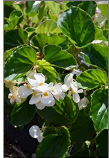
BabyWing White Begonia flowers