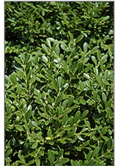
Franklin's Gem Boxwood foliage

Thank you for choosing Seoane's Garden Center