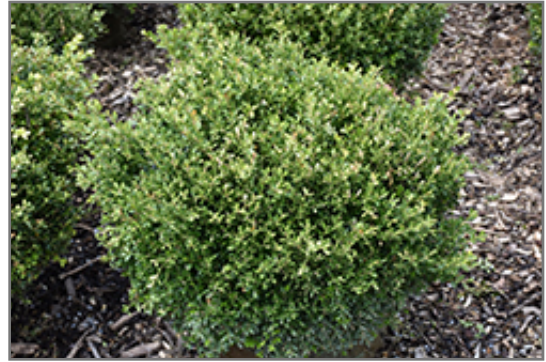
Franklin's Gem Boxwood

Franklin's Gem Boxwood is recommended for the following landscape applications;