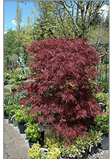
Red Dragon Japanese Maple

Red Dragon Japanese Maple is a fine choice for the yard, but it is also a good selection for planting in outdoor pots and containers. Because of its height, it is often used as a 'thriller' in the 'spiller-thriller-filler' container combination; plant it near the center of the pot, surrounded by smaller plants and those that spill over the edges. It is even sizeable enough that it can be grown alone in a suitable container. Note that when grown in a container, it may not perform exactly as indicated on the tag - this is to be expected. Also note that when growing plants in outdoor containers and baskets, they may require more frequent waterings than they would in the yard or garden.