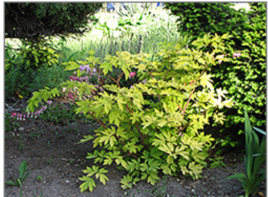
Gold Heart Bleeding Heart in bloom

Thank you for choosing Seoane's Garden Center