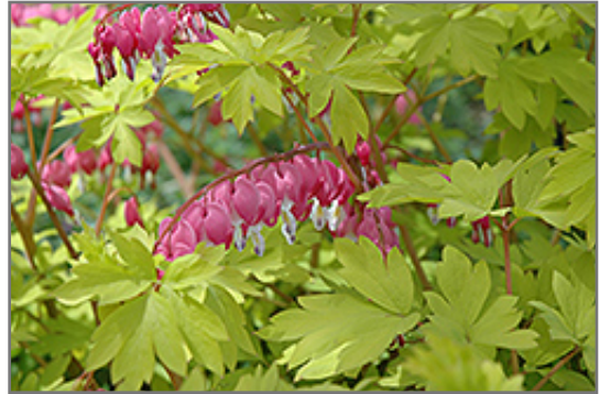
Gold Heart Bleeding Heart flowers