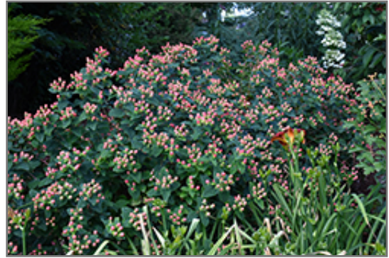
FloralBerry Rosé St. John's Wort fruit

FloralBerry Rosé St. John's Wort will grow to be about 3 feet tall at maturity, with a spread of 3 feet. It tends to fill out right to the ground and therefore doesn't necessarily require facer plants in front. It grows at a medium rate, and under ideal conditions can be expected to live for approximately 5 years. This is a self-pollinating variety, so it doesn't require a second plant nearby to set fruit.