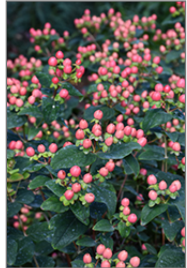
FloralBerry Rosé St. John's Wort fruit

FloralBerry Rosé St. John's Wort is recommended for the following landscape applications;