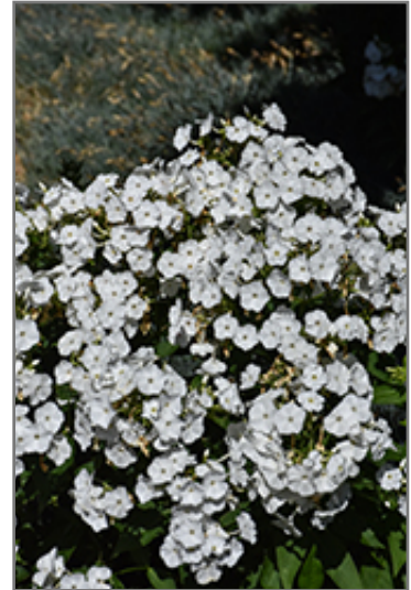
Volcano White Garden Phlox flowers

Volcano White Garden Phlox is recommended for the following landscape applications;