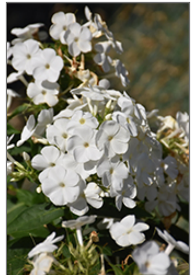
Volcano White Garden Phlox flowers

Thank you for choosing Seoane's Garden Center