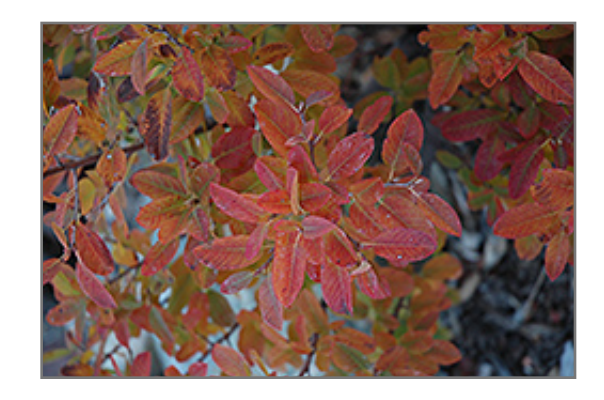
Rainbow Pillar Serviceberry in fall