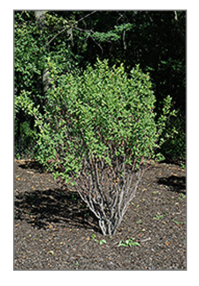
Rainbow Pillar Serviceberry