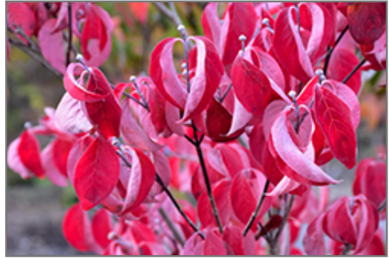
Cherokee Brave Flowering Dogwood in fall

Cherokee Brave Flowering Dogwood will grow to be about 30 feet tall at maturity, with a spread of 35 feet. It has a low canopy with a typical clearance of 4 feet from the ground, and should not be planted underneath power lines. It grows at a slow rate, and under ideal conditions can be expected to live for approximately 30 years.