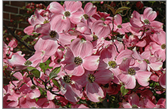
Cherokee Brave Flowering Dogwood flowers

This is a relatively low maintenance tree, and should only be pruned after flowering to avoid removing any of the current season's flowers. It is a good choice for attracting birds to your yard. Gardeners should be aware of the following characteristic(s) that may warrant special consideration;