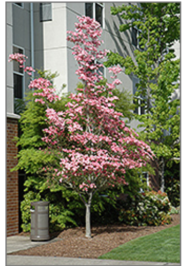
Cherokee Brave Flowering Dogwood in bloom

Thank you for choosing Seoane's Garden Center