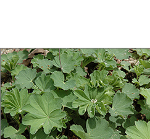
Auslese Lady's Mantle foliage