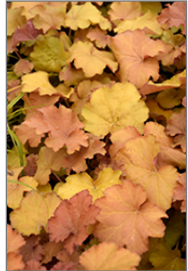
Caramel Coral Bells foliage

Caramel Coral Bells is recommended for the following landscape applications;