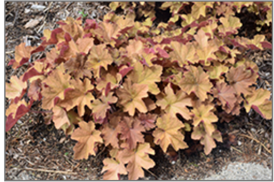
Caramel Coral Bells

Caramel Coral Bells will grow to be about 10 inches tall at maturity extending to 18 inches tall with the flowers, with a spread of 18 inches. When grown in masses or used as a bedding plant, individual plants should be spaced approximately 15 inches apart. Its foliage tends to remain low and dense right to the ground. It grows at a medium rate, and under ideal conditions can be expected to live for approximately 10 years. As an evergreen perennial, this plant will typically keep its form and foliage year-round.