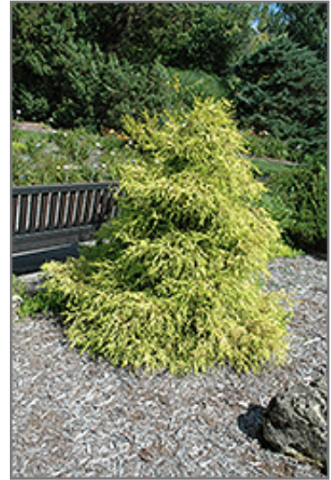
Lemon Thread Falsecypress

Lemon Thread Falsecypress is recommended for the following landscape applications;