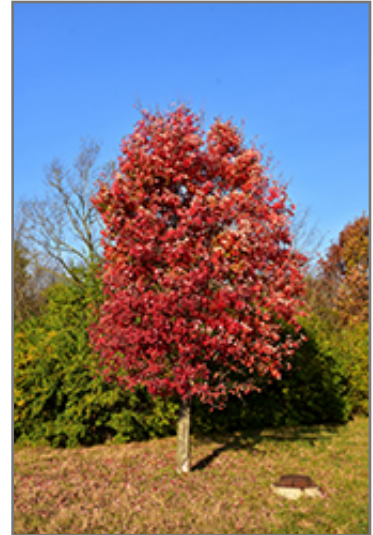
Autumn Flame Red Maple in fall