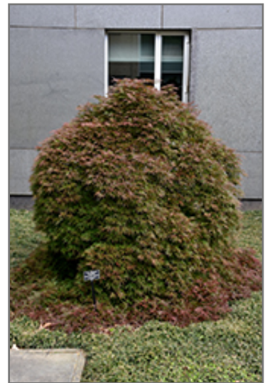
Orangeola Cutleaf Japanese Maple

Thank you for choosing Seoane's Garden Center