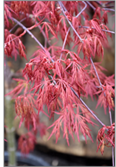
Orangeola Cutleaf Japanese Maple foliage

Orangeola Cutleaf Japanese Maple is a fine choice for the yard, but it is also a good selection for planting in outdoor pots and containers. Because of its height, it is often used as a 'thriller' in the 'spiller-thriller-filler' container combination; plant it near the center of the pot, surrounded by smaller plants and those that spill over the edges. It is even sizeable enough that it can be grown alone in a suitable container. Note that when grown in a container, it may not perform exactly as indicated on the tag - this is to be expected. Also note that when growing plants in outdoor containers and baskets, they may require more frequent waterings than they would in the yard or garden.