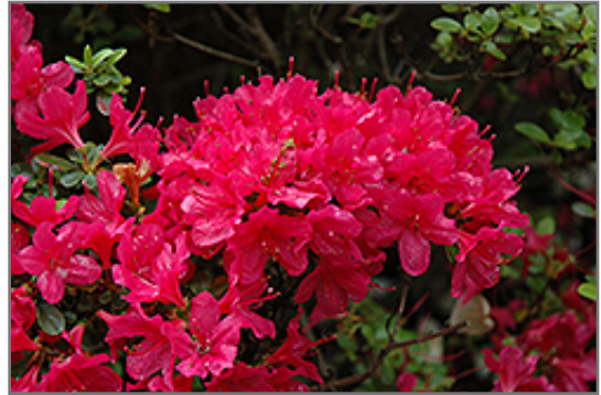
Hino Crimson Azalea flowers

This shrub does best in full sun to partial shade. You may want to keep it away from hot, dry locations that receive direct afternoon sun or which get reflected sunlight, such as against the south side of a white wall. It requires an evenly moist well-drained soil for optimal growth, but will die in standing water. It is very fussy about its soil conditions and must have rich, acidic soils to ensure success, and is subject to chlorosis (yellowing) of the foliage in alkaline soils. It is somewhat tolerant of urban pollution, and will benefit from being planted in a relatively sheltered location. Consider applying a thick mulch around the root zone in winter to protect it in exposed locations or colder microclimates. This particular variety is an interspecific hybrid.