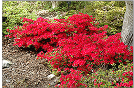
Hino Crimson Azalea in bloom

Thank you for choosing Seoane's Garden Center