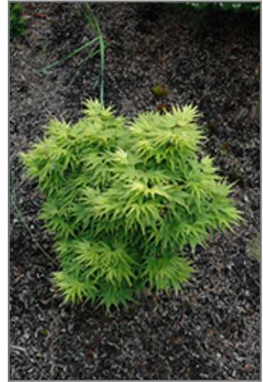
Mikawa Yatsubusa Japanese Maple

Mikawa Yatsubusa Japanese Maple is a fine choice for the yard, but it is also a good selection for planting in outdoor pots and containers. With its upright habit of growth, it is best suited for use as a 'thriller' in the 'spiller-thriller-filler' container combination; plant it near the center of the pot, surrounded by smaller plants and those that spill over the edges. It is even sizeable enough that it can be grown alone in a suitable container. Note that when grown in a container, it may not perform exactly as indicated on the tag - this is to be expected. Also note that when growing plants in outdoor containers and baskets, they may require more frequent waterings than they would in the yard or garden.