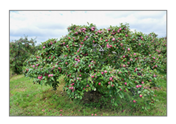
Macintosh Apple fruit

This tree is typically grown in a designated area of the yard because of its mature size and spread. It should only be grown in full sunlight. It prefers to grow in average to moist conditions, and shouldn't be allowed to dry out. It is not particular as to soil type or pH. It is highly tolerant of urban pollution and will even thrive in inner city environments. This particular variety is an interspecific hybrid.