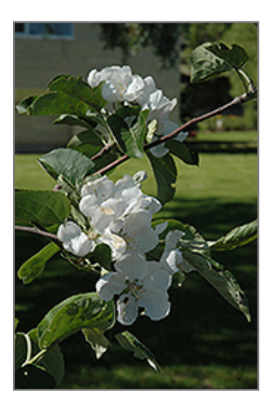
Macintosh Apple flowers