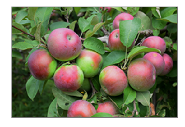
Macintosh Apple fruit

Macintosh Apple features showy clusters of lightly-scented white flowers with shell pink overtones along the branches in mid spring, which emerge from distinctive pink flower buds. It has forest green deciduous foliage. The pointy leaves turn yellow in fall. The fruits are showy red apples with hints of light green, which are carried in abundance in early fall. The fruit can be messy if allowed to drop on the lawn or walkways, and may require occasional clean-up.