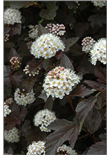
Diablo Ninebark flowers

Diablo Ninebark is recommended for the following landscape applications;