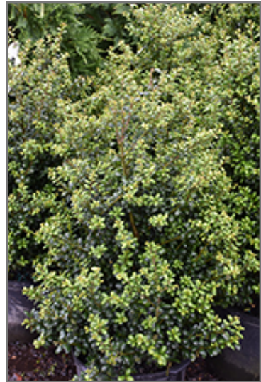
Chesapeake Japanese Holly

Thank you for choosing Seoane's Garden Center