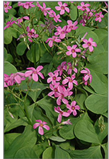
Pink Wood Sorrel flowers