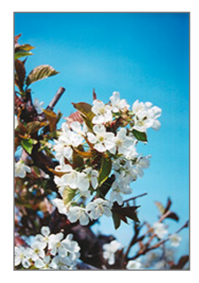
Bing Cherry flowers