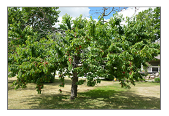
Bing Cherry fruit

This is a deciduous tree with a shapely oval form. Its average texture blends into the landscape, but can be balanced by one or two finer or coarser trees or shrubs for an effective composition. This plant will require occasional maintenance and upkeep, and is best pruned in late winter once the threat of extreme cold has passed. It is a good choice for attracting birds to your yard. Gardeners should be aware of the following characteristic(s) that may warrant special consideration;