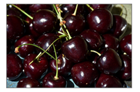
Bing Cherry fruit