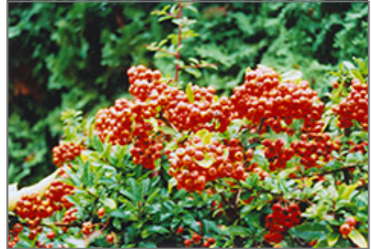
Yukon Belle Scarlet Firethorn fruit

Thank you for choosing Seoane's Garden Center