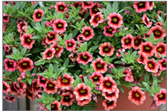
Superbells Coralberry Punch Calibrachoa flowers

Thank you for choosing Seoane's Garden Center