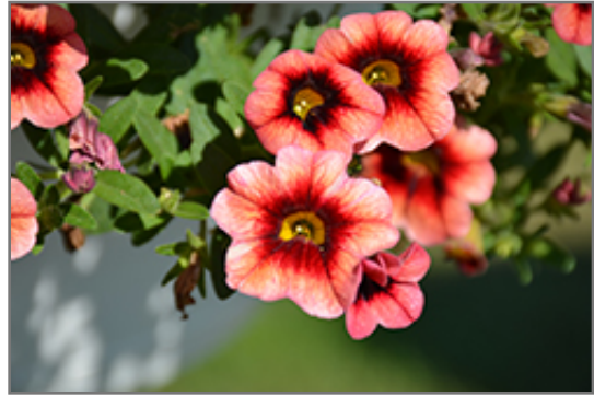
Superbells Coralberry Punch Calibrachoa flowers

Superbells Coralberry Punch Calibrachoa is a dense herbaceous annual with a trailing habit of growth, eventually spilling over the edges of hanging baskets and containers. Its medium texture blends into the garden, but can always be balanced by a couple of finer or coarser plants for an effective composition.