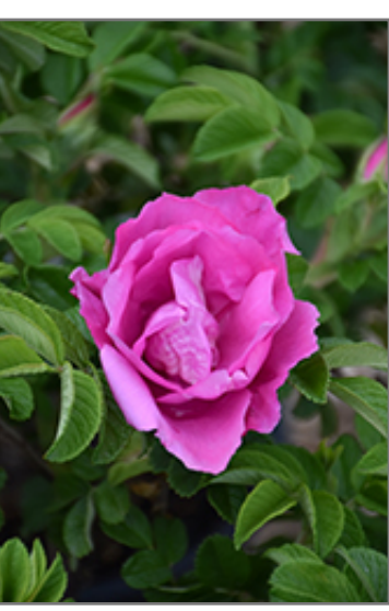
Foxi Pavement Rose flowers