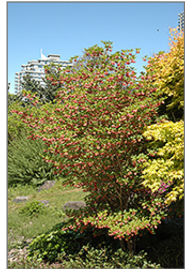
Redvein Enkianthus in bloom

Thank you for choosing Seoane's Garden Center