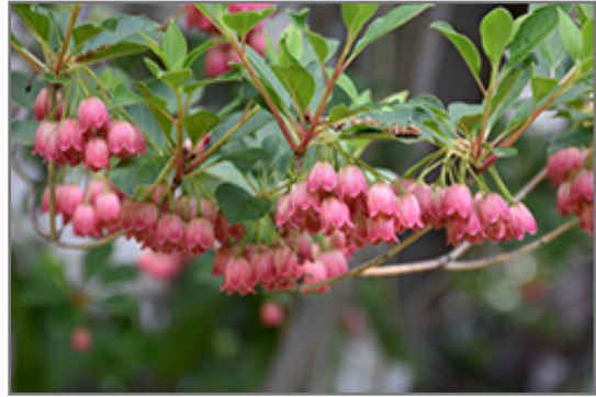
Redvein Enkianthus flowers