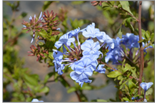
Imperial Blue Plumbago flowers

Imperial Blue Plumbago is recommended for the following landscape applications;