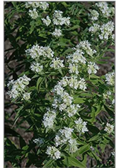
Hairy Mountain Mint in bloom

Thank you for choosing Seoane's Garden Center