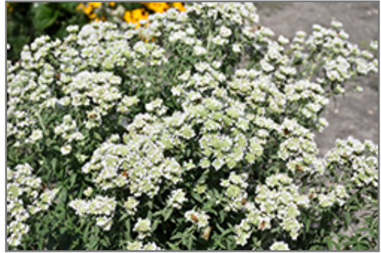
Hairy Mountain Mint flowers

Hairy Mountain Mint is recommended for the following landscape applications;