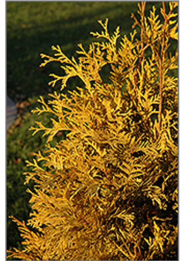
Yellow Ribbon Arborvitae in fall

This shrub does best in full sun to partial shade. It prefers to grow in average to moist conditions, and shouldn't be allowed to dry out. It is not particular as to soil type or pH. It is somewhat tolerant of urban pollution, and will benefit from being planted in a relatively sheltered location. Consider applying a thick mulch around the root zone in winter to protect it in exposed locations or colder microclimates. This is a selection of a native North American species.