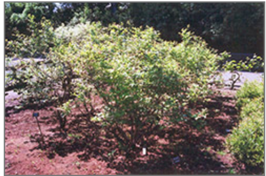
Northland Blueberry

Thank you for choosing Seoane's Garden Center