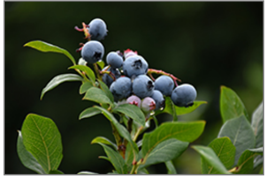
Northland Blueberry fruit