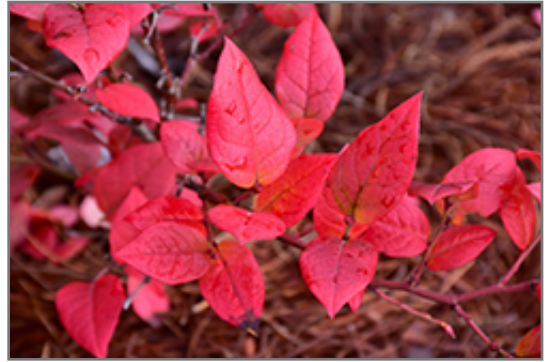
Northland Blueberry in fall