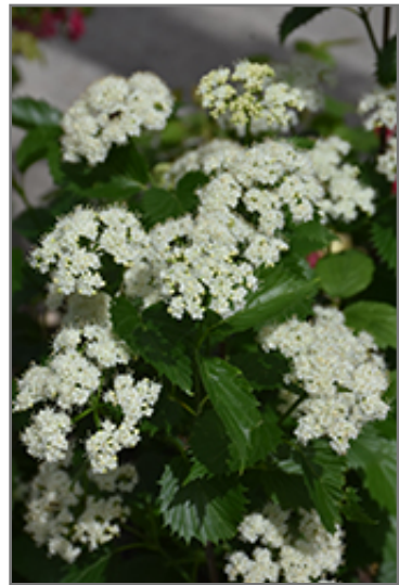
Blue Muffin Viburnum flowers

Thank you for choosing Seoane's Garden Center