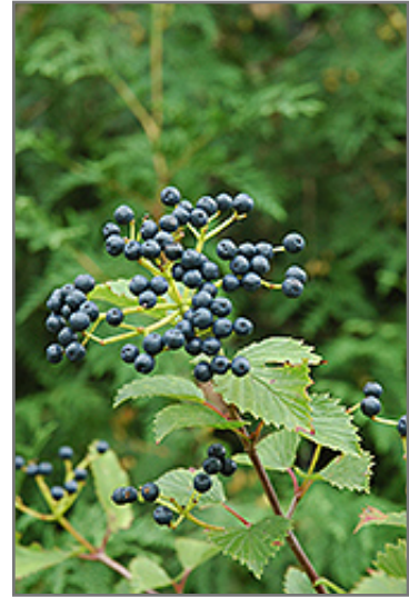
Blue Muffin Viburnum fruit

Blue Muffin Viburnum is recommended for the following landscape applications;