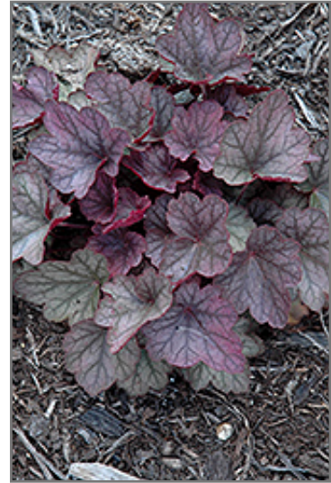
Carnival Rose Granita Coral Bells foliage

Carnival Rose Granita Coral Bells is recommended for the following landscape applications;