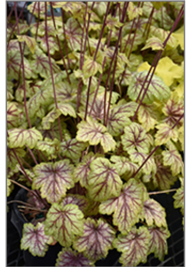
Circus Coral Bells foliage

Circus Coral Bells is recommended for the following landscape applications;