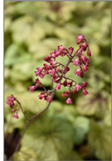
Circus Coral Bells flowers

* This is a 'special order' plant - contact store for details