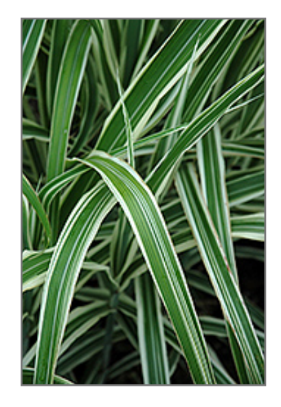
Cosmopolitan Maiden Grass foliage