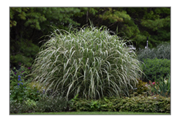
Cosmopolitan Maiden Grass

Cosmopolitan Maiden Grass is recommended for the following landscape applications;