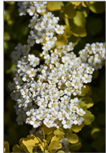
Glow Girl Birch Leaf Spirea flowers

Thank you for choosing Seoane's Garden Center