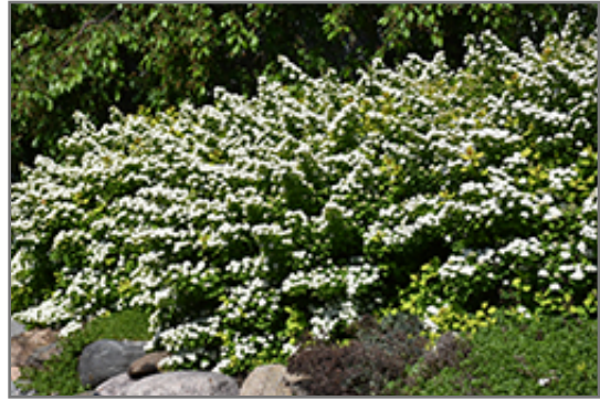
Glow Girl Birch Leaf Spirea in bloom

Glow Girl Birch Leaf Spirea is recommended for the following landscape applications;