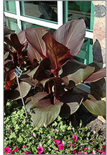
Tropicanna Black Canna

This plant is native to the tropics and prefers growing in moist environments with evenly warm conditions all year round. In our climate, it is usually grown as an outdoor annual in the garden or in a container. If you want it to survive the winter, it can be brought in to the house and provided with special care, and then returned to the garden the following season. In its preferred tropical habitat, it can grow to be around 5 feet tall at maturity, with a spread of 24 inches. However, when grown as an annual or when overwintered indoors, it can be expected to perform differently, and its exact height and spread will depend on many factors; you may wish to consult with our experts as to how it might perform in your specific application and growing conditions.