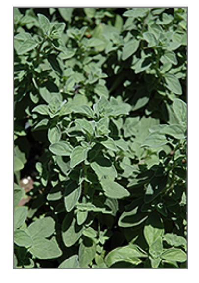
Italian Oregano foliage

551 Bedford St Abington, MA 02351 | 781-878-1306 | garden@seoanelandscape.com