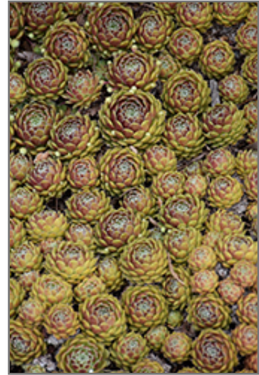
Piloseum Hens And Chicks

Piloseum Hens And Chicks is recommended for the following landscape applications;