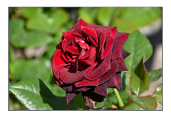
Black Baccara Rose flowers