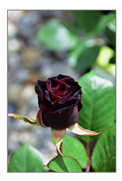
Black Baccara Rose flower buds