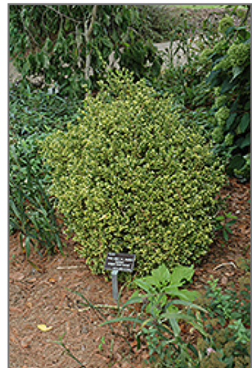
Sunburst Variegated Korean Boxwood

Thank you for choosing Seoane's Garden Center