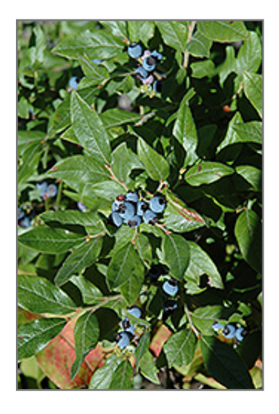
Lowbush Blueberry fruit

Lowbush Blueberry features dainty clusters of white bell-shaped flowers with shell pink overtones hanging below the branches in mid spring. It has dark green deciduous foliage. The oval leaves turn an outstanding scarlet in the fall. It features an abundance of magnificent blue berries in mid summer.