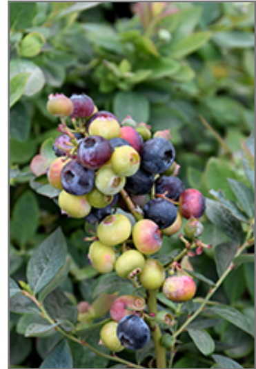
Pink Icing Blueberry fruit

This is a multi-stemmed deciduous shrub with an upright spreading habit of growth. Its relatively fine texture sets it apart from other landscape plants with less refined foliage. This is a relatively low maintenance plant, and usually looks its best without pruning, although it will tolerate pruning. It is a good choice for attracting birds to your yard. It has no significant negative characteristics.