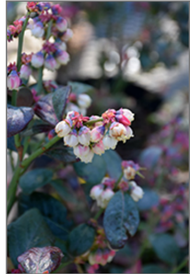
Pink Icing Blueberry flowers

This shrub is quite ornamental as well as edible, and is as much at home in a landscape or flower garden as it is in a designated edibles garden. It does best in full sun to partial shade. It does best in average to evenly moist conditions, but will not tolerate standing water. It is very fussy about its soil conditions and must have sandy, acidic soils to ensure success, and is subject to chlorosis (yellowing) of the foliage in alkaline soils. It is quite intolerant of urban pollution, therefore inner city or urban streetside plantings are best avoided, and will benefit from being planted in a relatively sheltered location. Consider applying a thick mulch around the root zone in winter to protect it in exposed locations or colder microclimates. This particular variety is an interspecific hybrid.