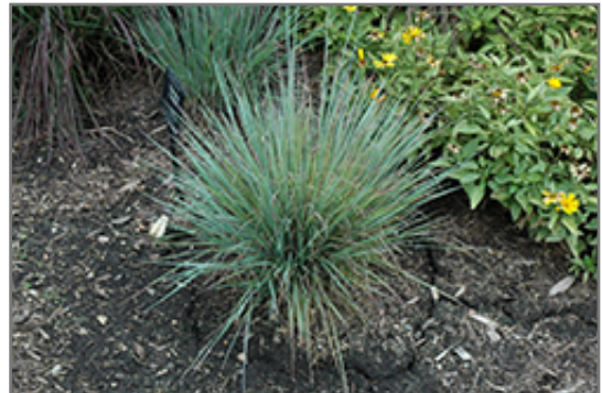
Standing Ovation Bluestem

Thank you for choosing Seoane's Garden Center