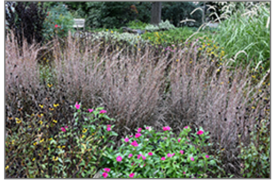
Standing Ovation Bluestem in fall

Standing Ovation Bluestem is recommended for the following landscape applications;