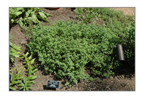
Greek Oregano

This is an herbaceous evergreen perennial herb with a mounded form. It brings an extremely fine and delicate texture to the garden composition and should be used to full effect. This is a relatively low maintenance plant, and should be cut back in late fall in preparation for winter. It is a good choice for attracting bees and butterflies to your yard, but is not particularly attractive to deer who tend to leave it alone in favor of tastier treats. It has no significant negative characteristics.