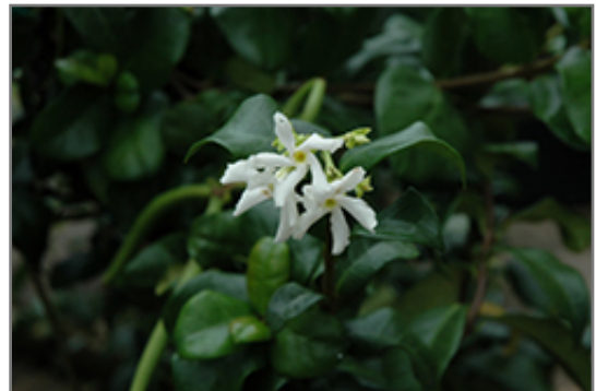
Madison Star-Jasmine flowers

Thank you for choosing Seoane's Garden Center