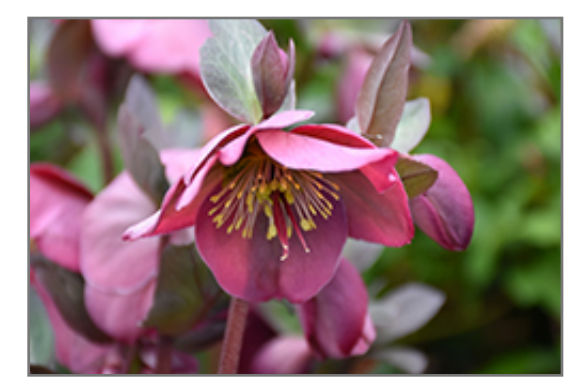
Penny's Pink Hellebore flowers