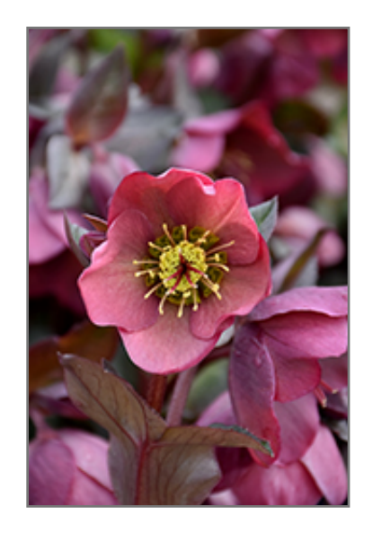
Penny's Pink Hellebore flowers