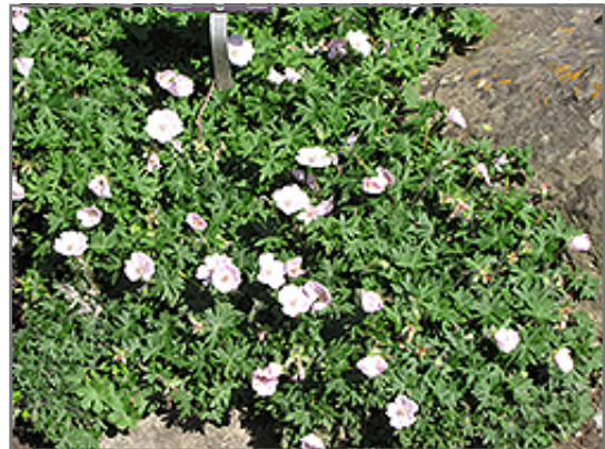
Striated Cranesbill in bloom

Thank you for choosing Seoane's Garden Center