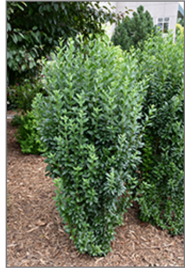
Straight Talk Privet