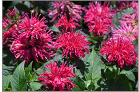
Balmy Rose Beebalm flowers