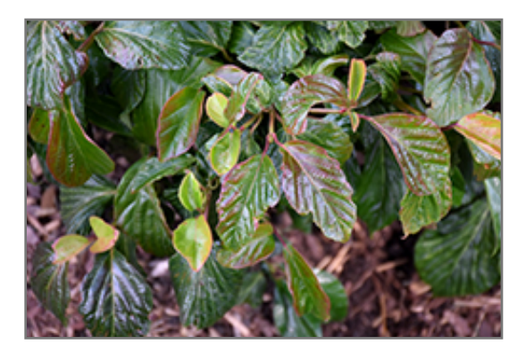
Shiny Dancer Viburnum foliage