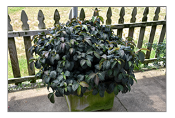
Shiny Dancer Viburnum

Shiny Dancer Viburnum is recommended for the following landscape applications;