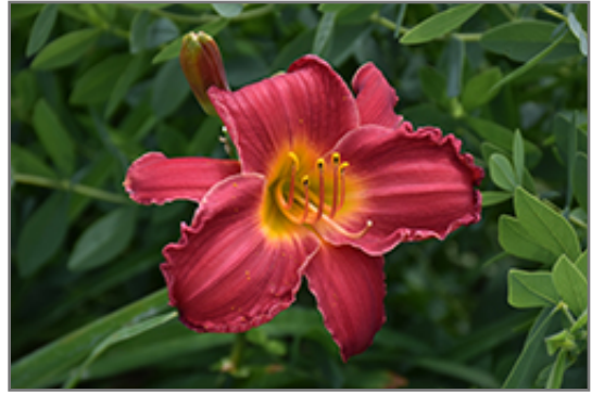
Happy Ever Appster Dynamite Returns Daylily flowers

Thank you for choosing Seoane's Garden Center