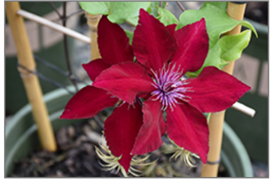
Boulevard Nubia Clematis flowers

Boulevard Nubia Clematis is recommended for the following landscape applications;